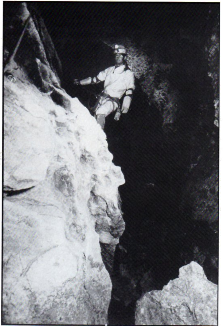
Azpilcueta: Climbing a bolted route into Slick and Side fault chamber (found 1991)

Exploration occurred at the upstream (southwest) end of Renada where some new passage was entered and prospects