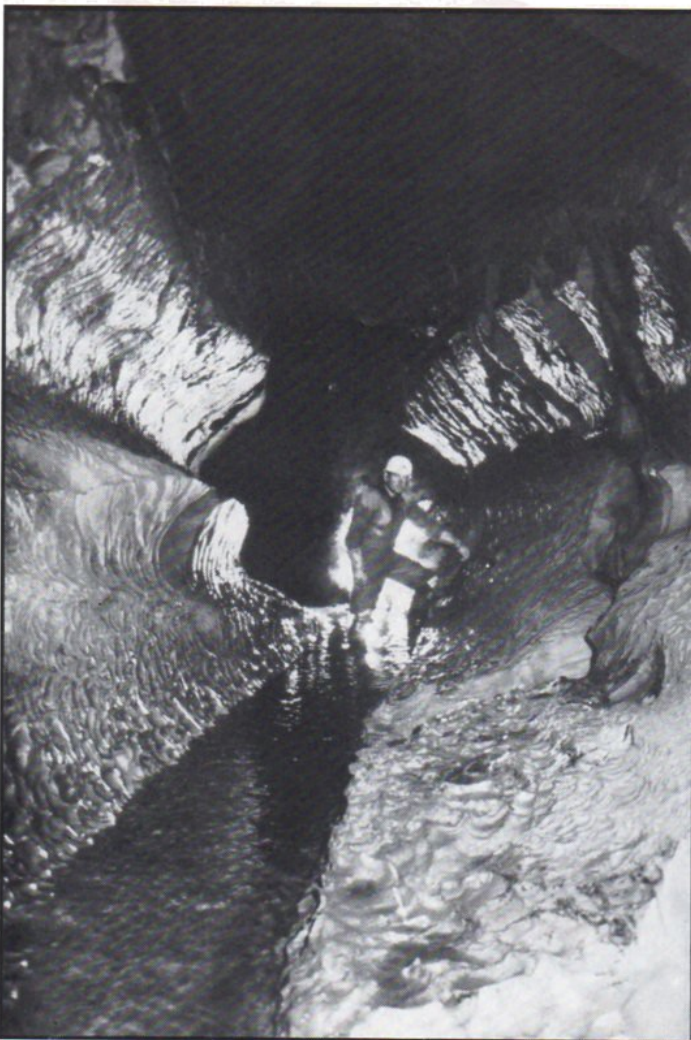
Penajoroa: Phil Pappard in Main Canal downstream of boulder choke.