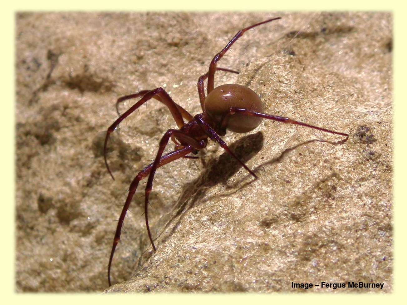
Orb Spider (Meta bourneti) in Cueva del Agua

We are building on this open research model and seek to work with an ever growing group of contributors, both voluntary and in a professional capacity. There is still a long way to go however and we are currently seeking funding to carry out genetics analysis work on the most intriguing and hard to indentify specimens. This will enable further linkages be to made between organisms and species groups both fully subterranean and transitory from surface, together with environmental conditions data it will all add to the slowly growing picture of whole cave biome. This in turn will determine the niche of terrestrial species in the ecology of these caves and their importance to full adapted hypogean species of the deep underground ecosystem.